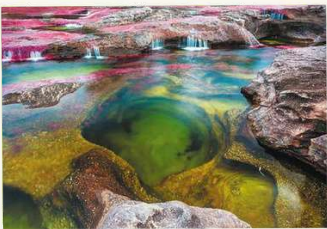
Caño Cristales, Meta.

As June is the month of biodiversity, we want to exalt the beauty of Colombia's fascinating landscapes in the pages of this edition and celebrate the fact that we are one of the most biodiverse countries in the world. In this newsletter you will find a variety of events in Austria and in our concurrences related to Colombian culture, ranging from rock art in the Serranía de la Lindosa to performances of classical music with a Colombian touch. We invite you to participate!