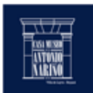
Casa Museo Antonio Nariño y Álvarez Villa de Leyva