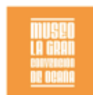
Museo de la Gran Convención Ocaña, Santander

The museums of the Ministry of Culture present to the public a varied and interactive virtual program, where you can find temporary and itinerant exhibitions, activities, guided tours, visits of secret places in the museums, etc.